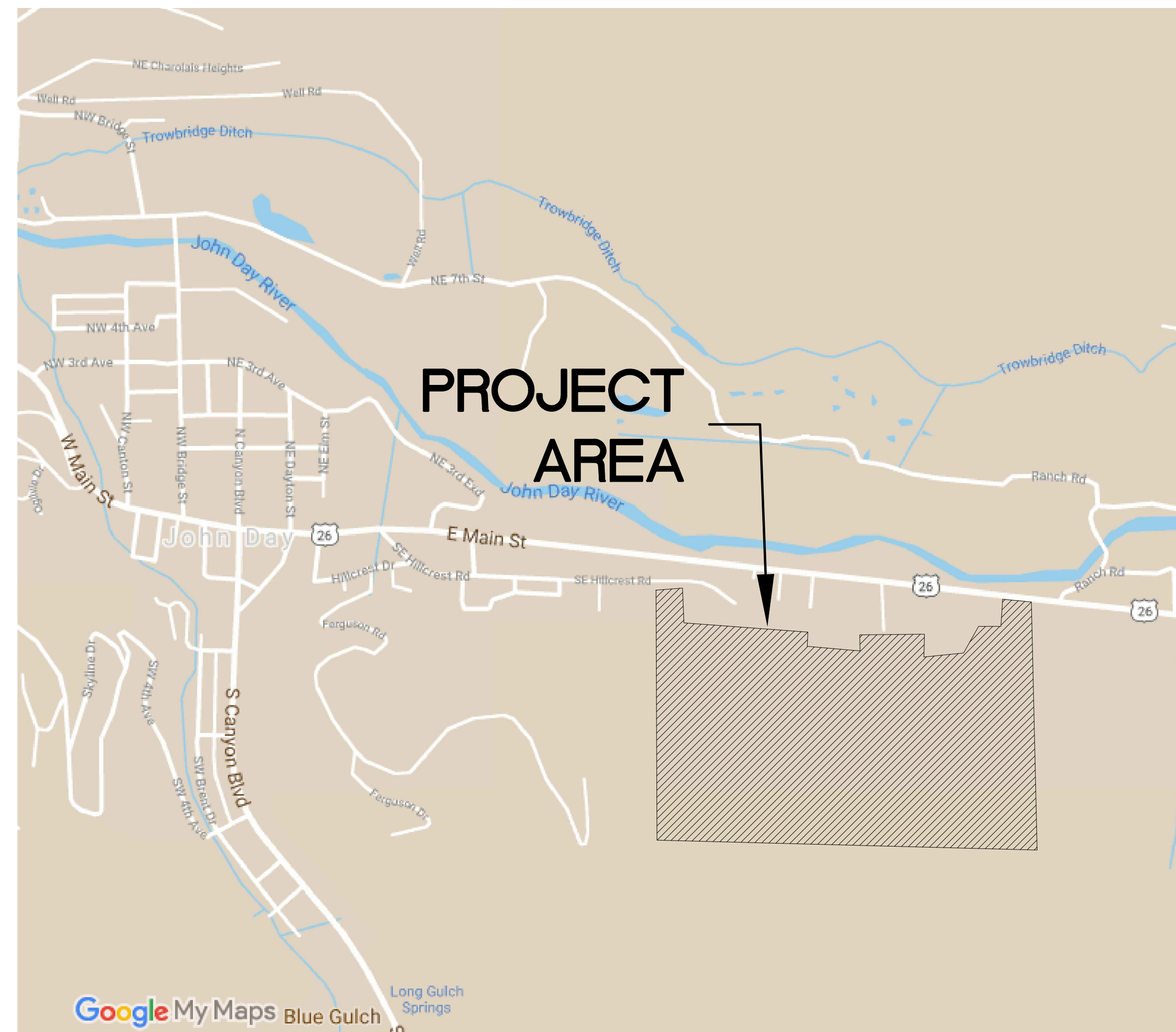
SITE MAP FROM GOOGLE MAPS NTS

314 A AVENUE SENECA, OR 97873 CONTACT: JOSH WALKER PH: 541-620-2992