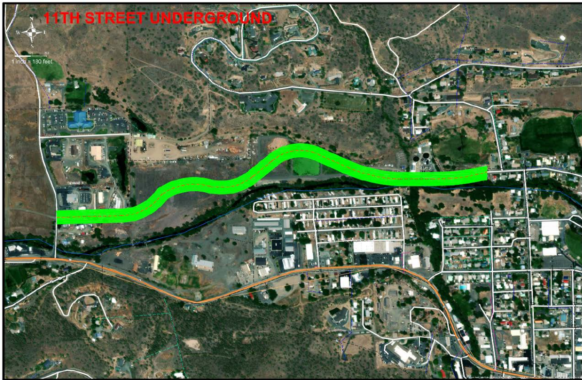
7 th Street Underground

4005 23 rd Street · PO Box 226 · Baker City, Oregon 97814 Phone (541) 523-3616 · Fax (541) 524-2864