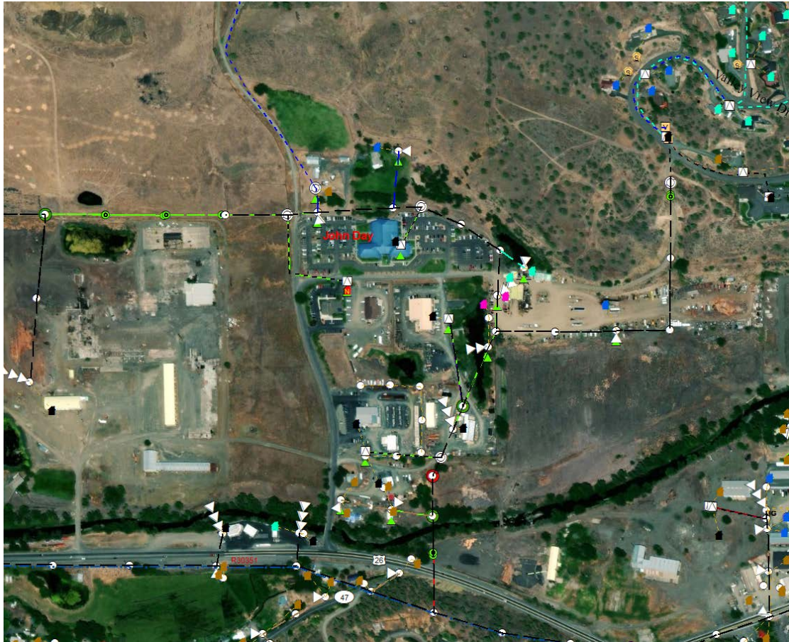
Patterson Voltage Conversion Areal View

4005 23 rd Street · PO Box 226 · Baker City, Oregon 97814 Phone (541) 523-3616 · Fax (541) 524-2864