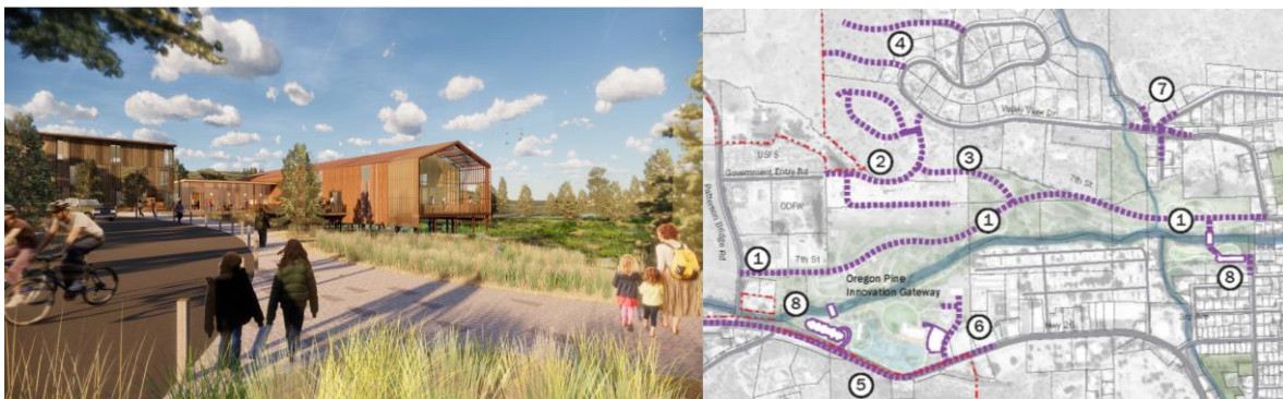
Renderings of the Innovation Gateway Area Plan at the former Oregon Pine mill site (top), new hotel and event center (bottom left), and proposed street improvements (bottom right).

The City intends to sell at least 12, one-acre parcels in this area for mixed use (commercial-industrial) development to private sector investors, including our own residents. If you are looking for a place to expand your business or are interested in purchasing property within this area, please contact city hall at (541) 575-0028 or by email at cityofjohnday@grantcounty-or.gov .