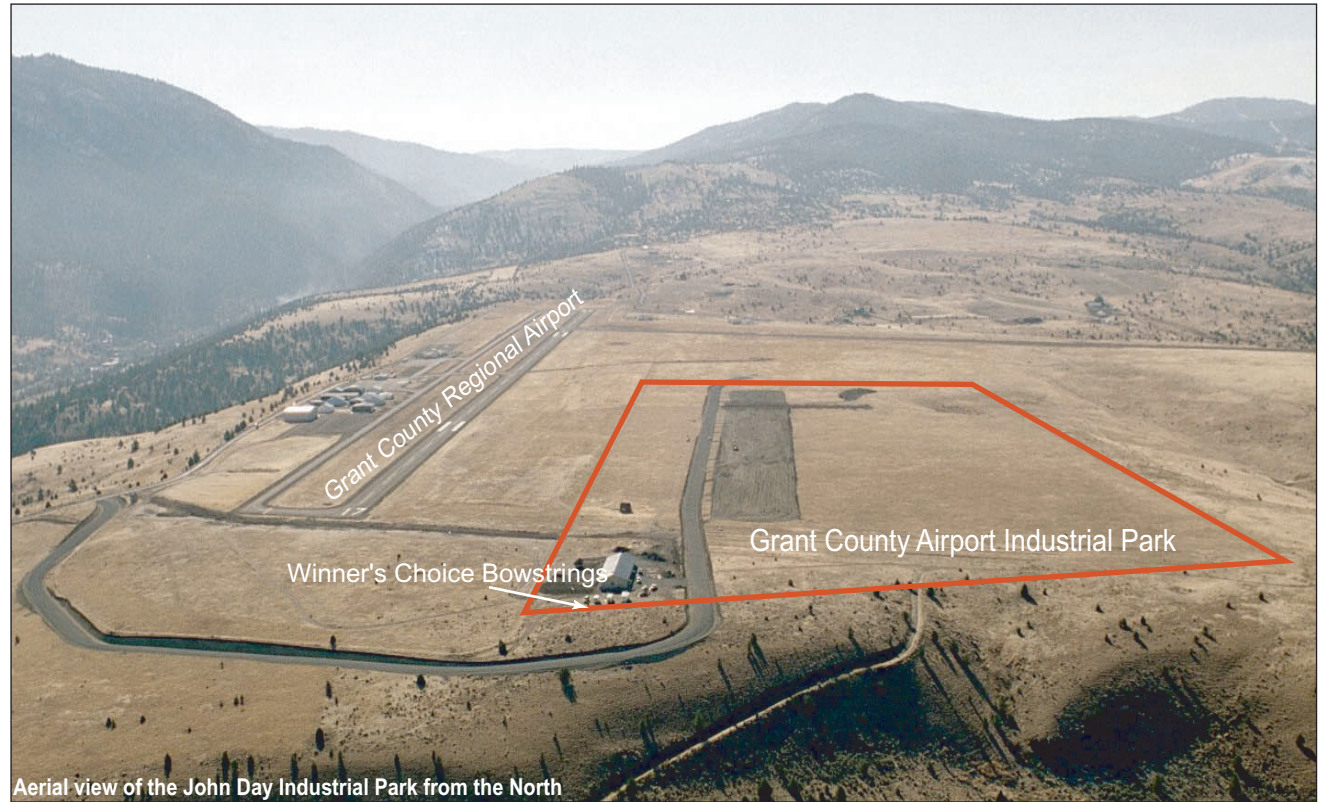
Aerial view of the John Day Industrial Park from the North

Winner's Choice Custom Bowstrings, the first tenant in the industrial park, opened the doors to their new facility in December 2003.