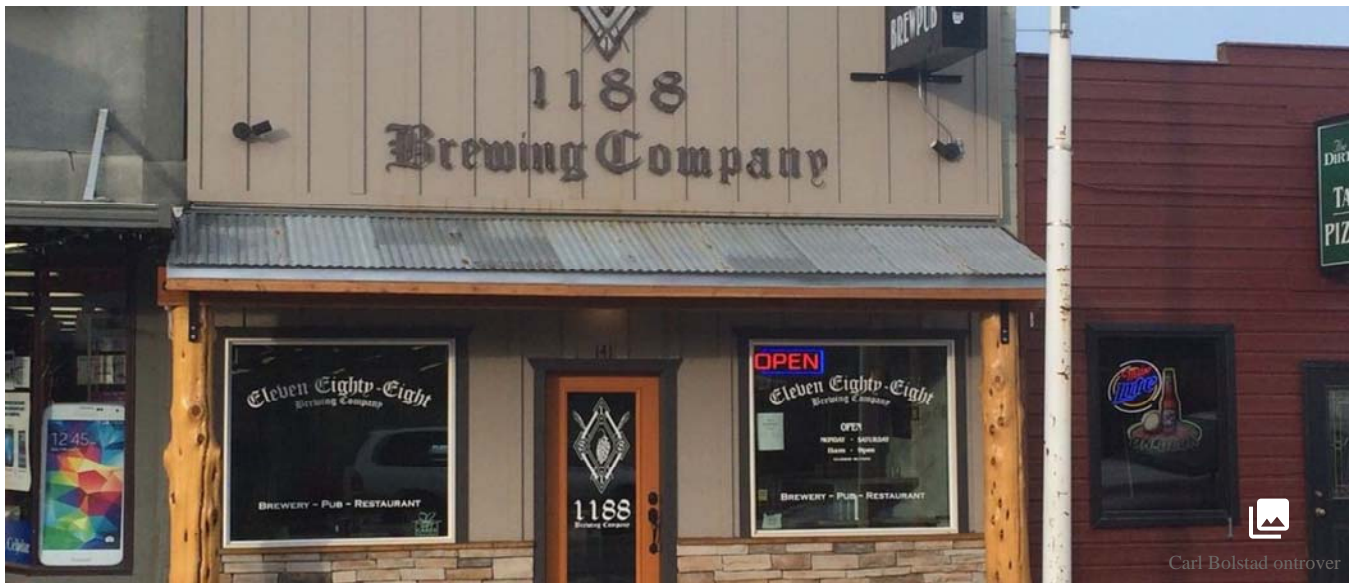
Carl Bolstad ontover