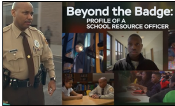
Not in Our Town and the COPS Office present the documentary, " Beyond the Badge: Profile of a School Resource Officer "